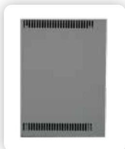
Additional Dryer Modular Dryer System X133