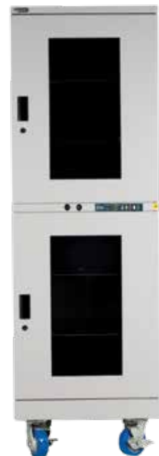
XDx-702-x, Volume 700ℓ 3