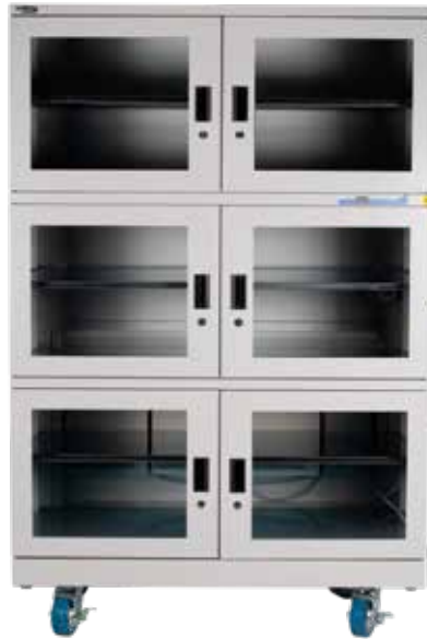
XDx-1106-x, Volume 1100ℓ 3

XDry cabinets are the ideal solution for printed circuit board and moisture-sensitive component storage.