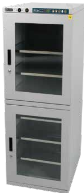
XD1-302-02, Volume 300ℓ 3