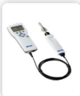
RH/C° Data Recorder NIST Certifiable RH/ Temp data logging units