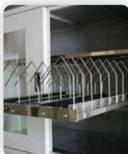
Sliding Reel Rack