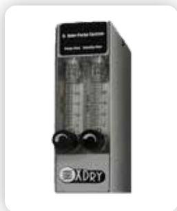
Xtra-GAS N2 Systems