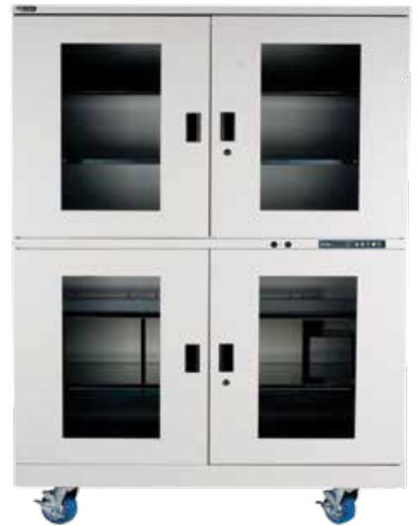
XDx-1104-x, Volume 1100ℓ 3