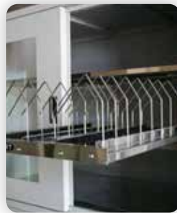
Sliding Reel Rack