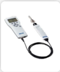
RH/C° Data Recorder NIST Certifiable RH/ Temp data logging units