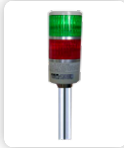
Alarm Light Tower